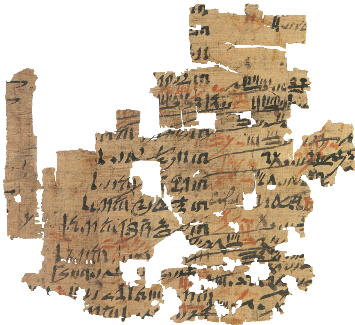
Fig. 3. A list of households responsible for producing textiles, with quotas in black ink and actual production in red ink (P. UC 32797a = "Y", recto; © UCL; partial transcription in Gardiner [1948b: 24–26]; translation in Kemp & Vogelsang [2001: 431])